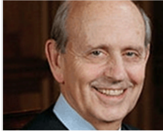
Justice Stephen Breyer

Albright was the 64th Secretary of State of the United States. In 1997, she was named the first female Secretary of State and became, at that time, the highest ranking woman in the history of the US government.