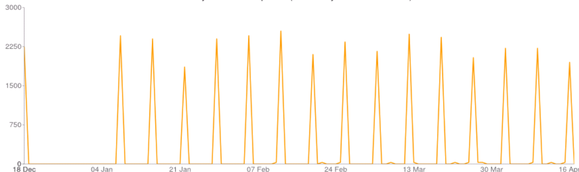
Daily newsfeeds opened (tracked by header download)

Our analytics reporting reveals exactly what your team members are reading. You can then accurately gauge hot topics and, ultimately, tailor education and training to the topics that are known to be of interest.